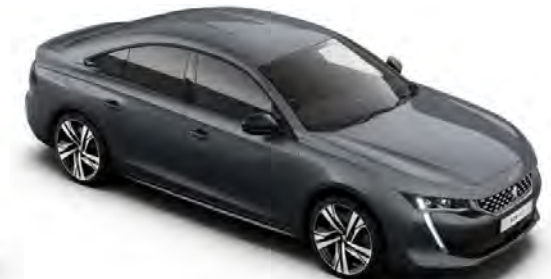
Car showing with optional 19" Augusta Alloy wheels